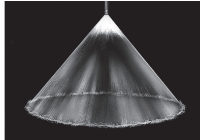
Hollow cone 90°